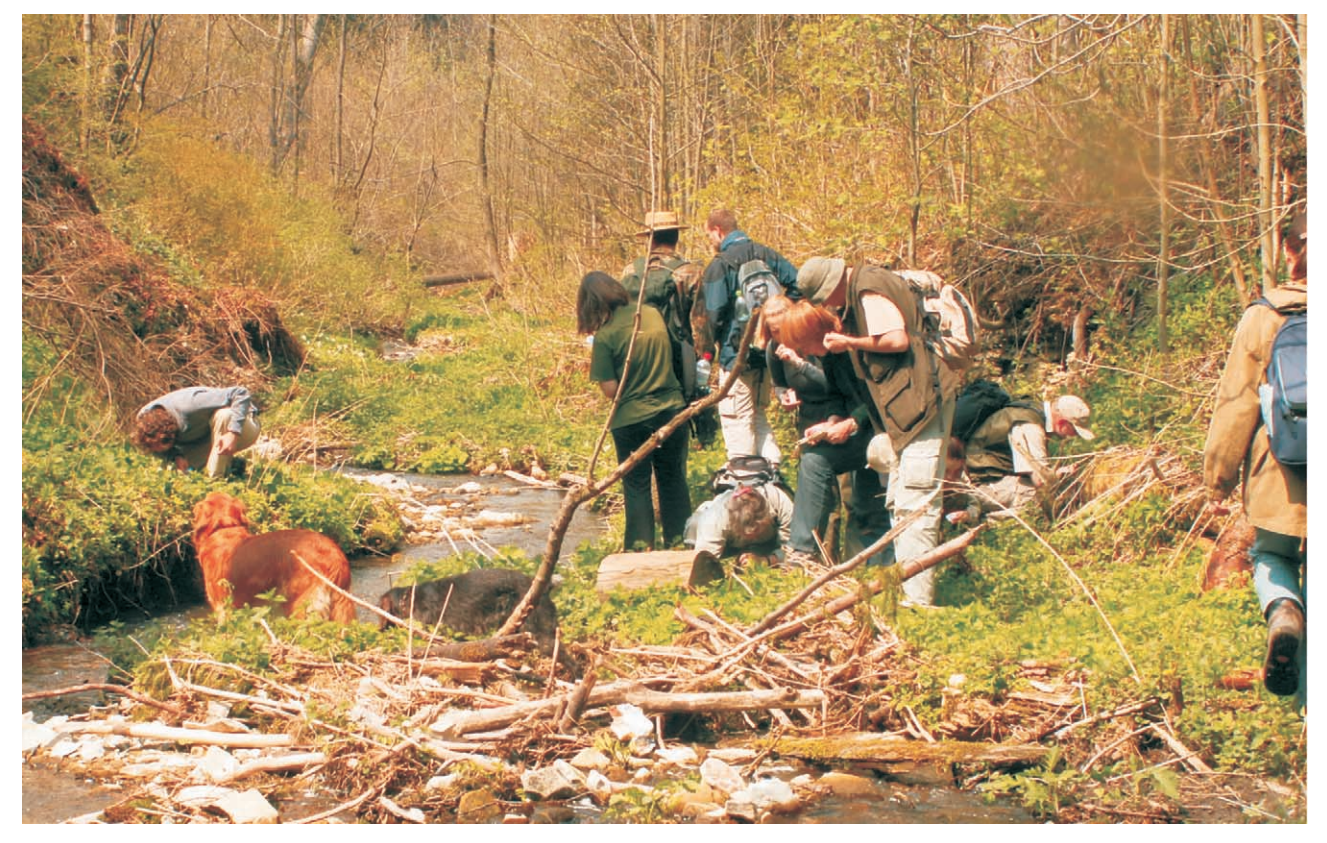
Fig. 1. Malacodays 2006. Happy malacologists in the Scorpion Valley (Czech Republic) where we even found Erjavecia bergeri .

BOGAN (USA), LÎGA OZOLIŇA-MOLL (Latvia) and VOLDEMÂRS SPUŇĚIS (Latvia). The number of participants was 29 (possibly more, but 29 are listed in the List of Participants), the number of authors of lectures and posters - 42. The Baltic countries represented were, Latvia (8 people), Lithuania (1), Estonia (1), Germany (2), Sweden (2), Russia (1), Finland (1) and Poland (10 participants plus one accompanying person - the record number; long live Polish malacology!), non-Baltic countries: USA (1), Slovakia (1) and Kirghiz Republic (1). Initially there were rumours about some three rather non-Baltic Nigerian participants but in the end they did not materialise. We stayed in various hotels, scattered all over the city, according to our respective preferences and pockets ours was very nice. On the first day (21st), afternoon, we registered for the conference, everybody was given the Programme & Abstracts Book (Fig. 2), a Symposium Bag and a Symposium Mug, we listened to three historical lectures: on non-marine malacology in Sweden, malacology in German-speaking countries and malacological science in Latvia and Lithuania. We were given tea, coffee and snacks and shown the Museum. The 22nd was a hard day because the Organisers, probably wanting to leave time enough for the excursion and other pleasures, crammed all the lectures and the poster session in this one day. There were 20 lectures (a lunch break with a very good lunch), followed by the poster session (nine posters)