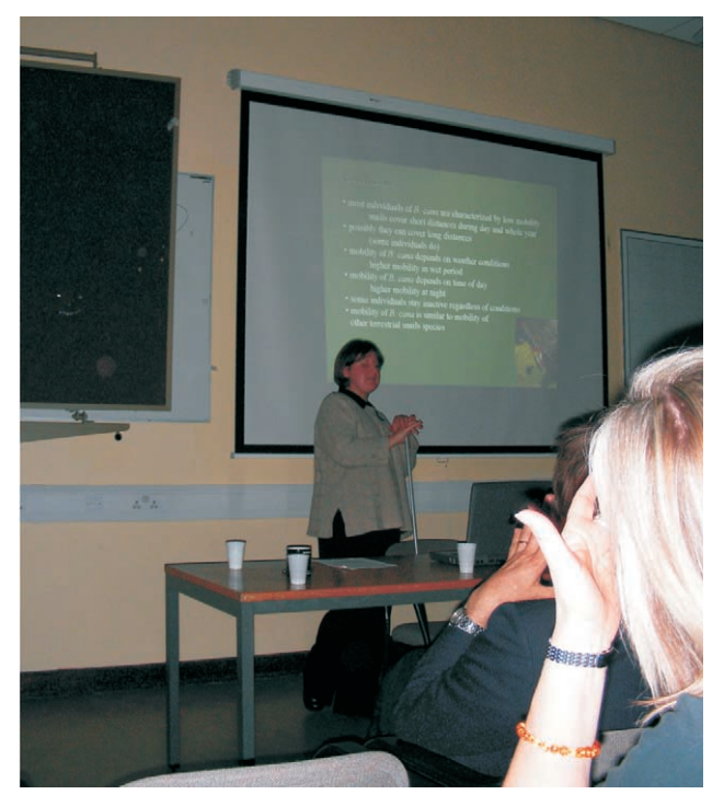
Fig. 4. Molluscan Forum 2006. A young malacologist performing bravely.

you, especially during the reception. It only remains to congratulate The Malacological Society and the Museum on the initiative: no participation fee, travel funds for those who have no money, sometimes the first and only possibility for a young malacologist to present and discuss their results. The end products are many: co-operation, mutual invitations, papers written together, materials exchanged, friendships... name it! For details regarding the next year Forum look at http://www.malacsoc.org.uk/Molluscanforum07.htm, in August or September.