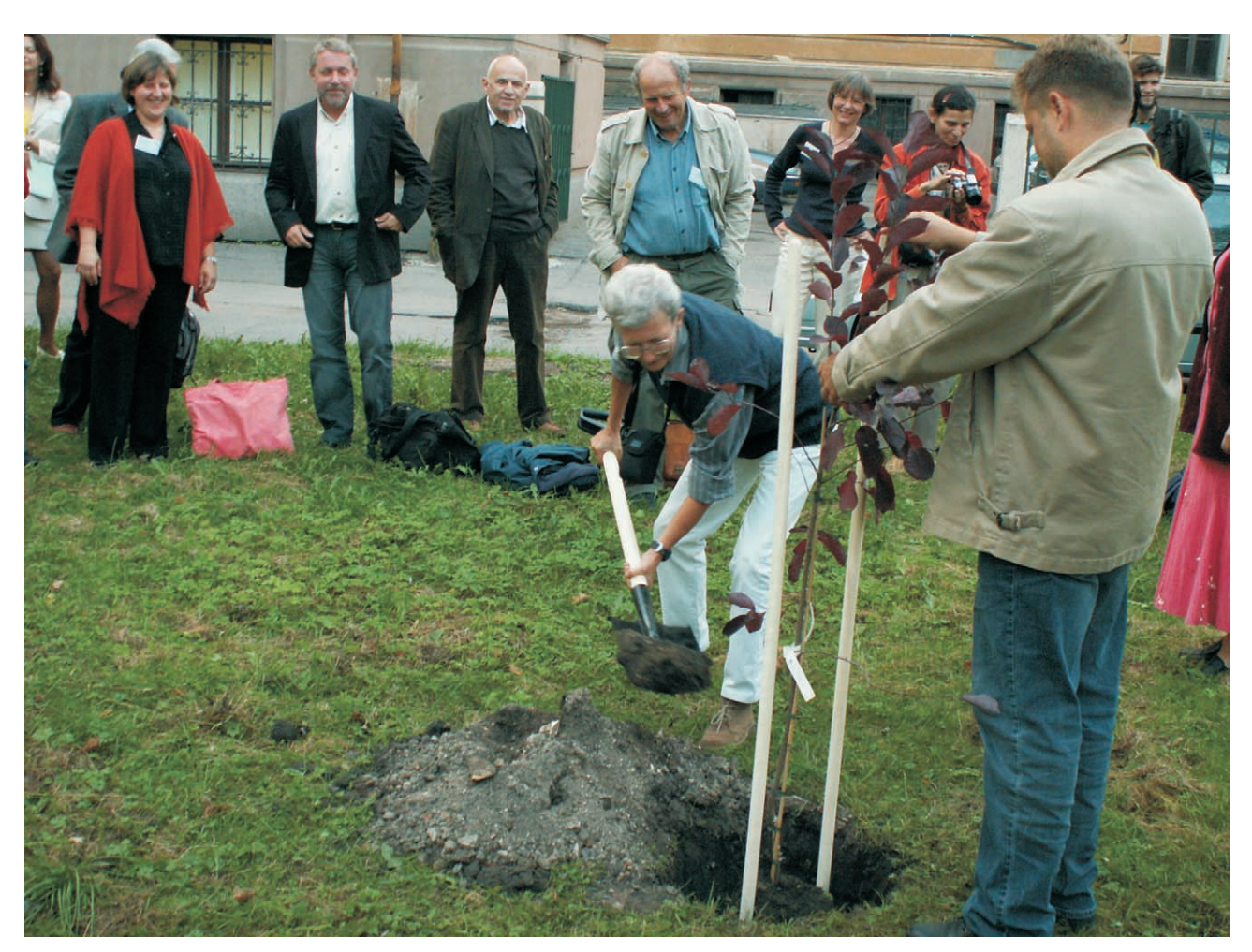
Fig. 3. The 1st Baltic Symposium on Malacology. Ceremonial planting of the Symposium tree.